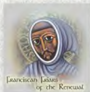
FRANCISCAN FRIARS of the RENEWAL

Let them inspire you to accept God's Unconditional Love, Forgiveness and Unfathomable Mercy.